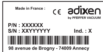
Fig. 1: Identification label