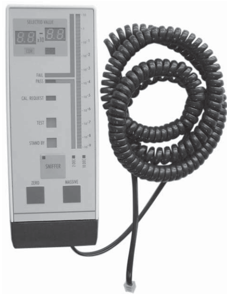
Fig. 3: Special sniffing remote control

The special sniffing remote control for sniffing leak detectors must be used only with the ASM 102 S and ASM 142 S.