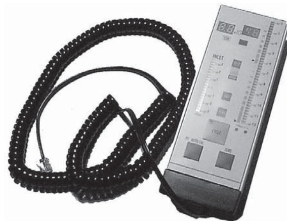
Fig. 2: Standard remote control

The standard remote control can be used with all the ASM xxx leak detectors, excepted the ASM 102 S and ASM 142 S.